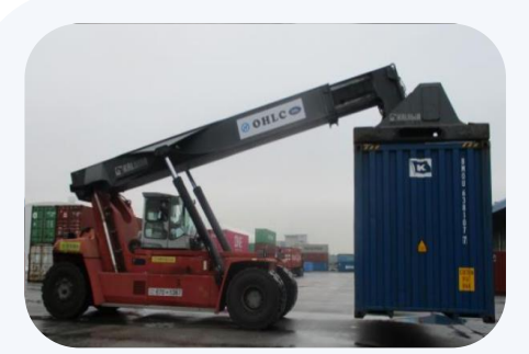
Reach Stacker (45 Ton / 1ea)