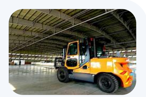
Fork Lift (4.5 ~ 3.3 Ton / 4ea)