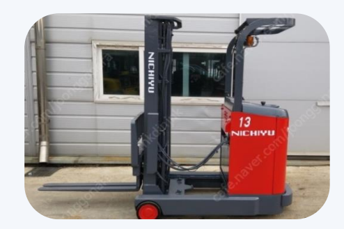
Electric Fork Lift (1.8~1.5 Ton / 2ea)