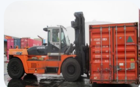
Fork Lift (25 Ton / 1ea)